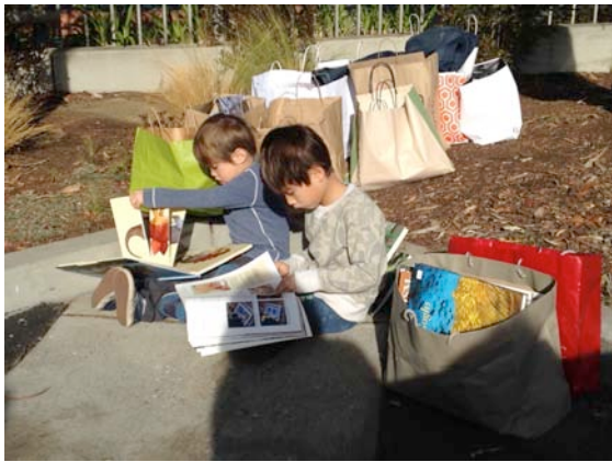
Enjoying our Saturday Book Sale

These sales are only possible with the support of our wonderful volunteers who contribute time and energy before, during and after the sales. It is only with this great combined effort that we can continue to provide our patrons with the quality and organization of our sales.